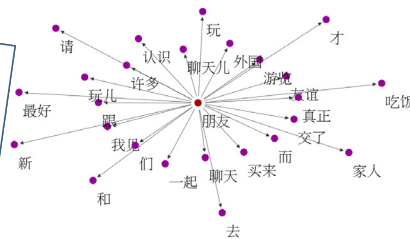
Collocation network for '朋友'[3a-MI (5), L5-R5, C10-NC10]